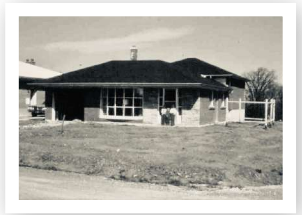
1188 Grange Road, late 1960s

Meanwhile, back on Grange Road, I began the settling-in process. I could never have imagined how difficult it was to keep clothes and floors clean before the landscaping was done. It was that red soil that stuck to everything. It became the bane of my existence when it came to gardening! Digging in that soil was backbreaking! But surprisingly, over the years, we