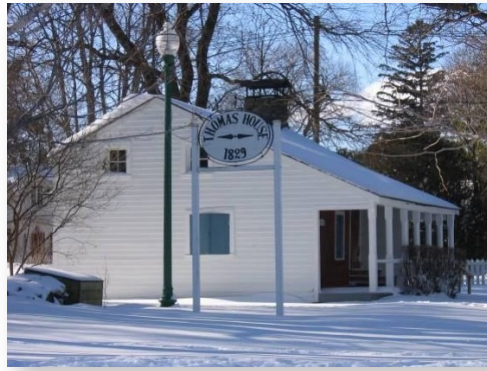
Thomas House Museum

All tours are 2 hours long. Except for the Trafalgar Rd walk, light refreshments are offered after the tour, when there is an opportunity for discussion and viewing of our office displays. Groups may book a private tour and guides are available for bus tours and private talks. Call 905 844-2695