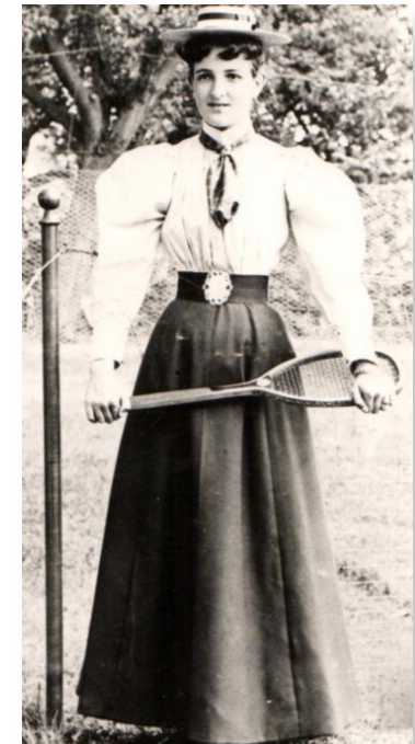
Woman at Tennis Club