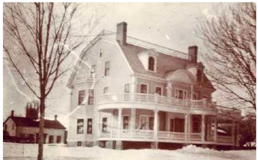
Mount Vernon, now Lakeside Park on Front Street.

I remember the burned-out remains of the beautiful home called Mount Vernon which caught fire in 1928.