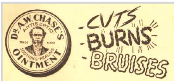
Dr. A. W. Chase's Calendar Almanac 1949