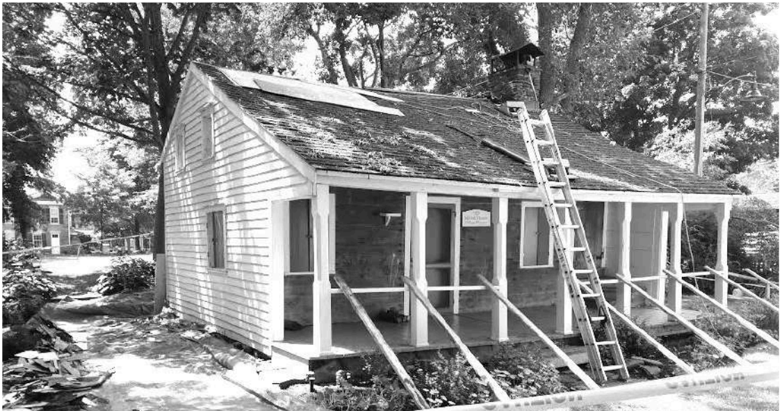
Our Thomas House roof is being prepared to receive a fresh new treatment.

We look forward to welcoming you in 2023.