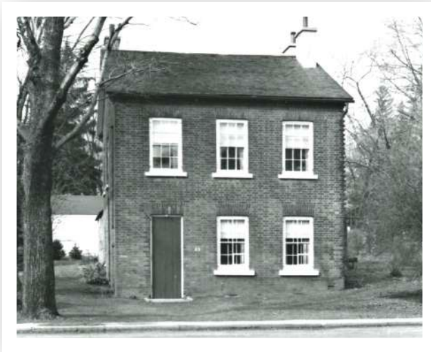
293 Macdonald Road. photo 1957