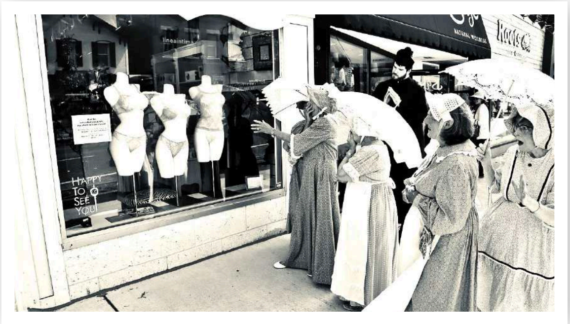
Fine ladies of Oakville with a trusted escort are distracted during a walk about town searching for QR code decals.

team of Kay and Gordon of the BIA provided the folksy music in the background and looked after the technical details that makes the text come up over the photos and come alive. Then the BIA installed the decals in the downtown area. It was a great partnership between the OHS and the BIA, each providing their unique talent and material. We