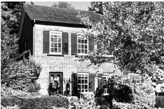
293 Macdonald Road. photo 2022

Oakville was built on the vision of William Chisholm as a port with "a rich and densely settled back country for 40 miles, of which Oakville must always be the market and shipping port." For this vision to be realized, the farm produce - mainly wheat - of this hinterland had to be moved to a shipping point, Oakville harbour, using the rough and hazardous facility of the 7th Line (now Trafalgar Road). It was only passable when dried out or frozen. In the 1840s, the first attempt to improve the 7th Line was undertaken. A joint stock company with headquarters in Oakville's post office was formed in 1846 with $7,000 capital to construct the first 19-mile section of roadway from Oakville to Stewart Town (now part of Georgetown). Ultimately the road extended about 60 miles to Fergus. The road was built on 4" square longitudinal sleepers on which 3" planks were laid crosswise. It was a very expensive road. The rewards to the enterprising builders were tolls collected at toll gates set up every few miles along the road.