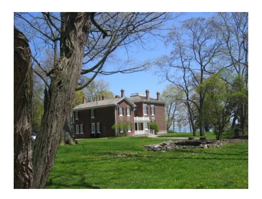
Erchless Estate – next door to OHS

The renovated building now houses the Society's archives, a collection of historical documents pertaining to the history of the Town of Oakville.