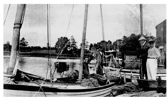
Herring Fishing, Bronte

A new opportunity was developed by residents who turned to mining slabs of slate from the shallow