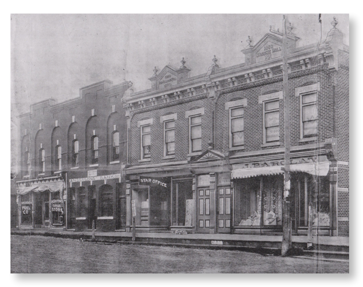
Colborne Street c1893 (now Lakeshore Drive) at the corner of Navy Street. The storefronts Morden Fuel and Anderson's Bank were once Town Hall and Police Office