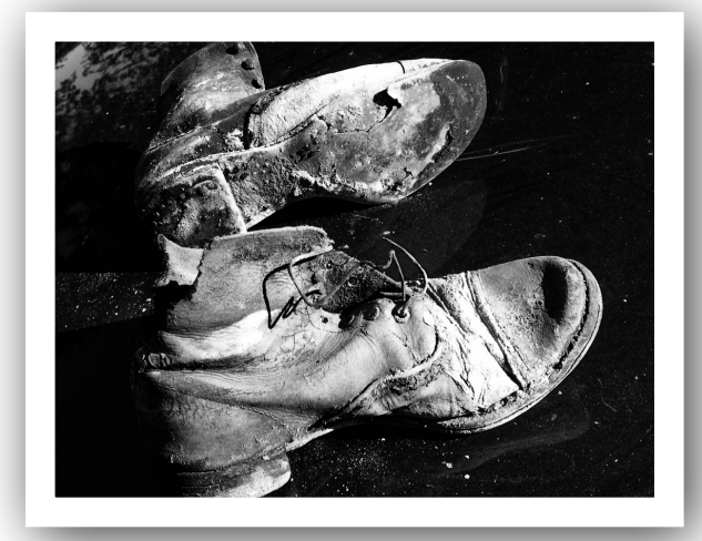
Found boots.

We are currently restoring the columns and piers at the front porch of an Oakville house south of Lakeshore Road. The piers were in the process of collapse, and the severe infestation by carpenter ants had begun. Right below the threshold we found a pair of boots concealed in the dirt. They appear to have been placed there when the porch was constructed with the house in 1910. This conforms with the ancient superstition that a hidden shoe could ward off evil from entering a building. However, usually shoes are found singly and over door heads or behind chimneys, not outside the entry.