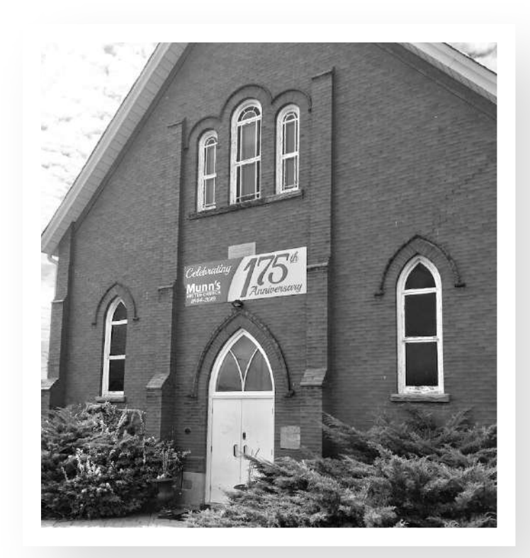
Munn's United Church

We hope you will enjoy visiting this and the other sites which you will find listed on the Doors Open Ontario website under Doors Open Halton.