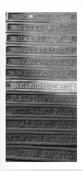
Plaques when found