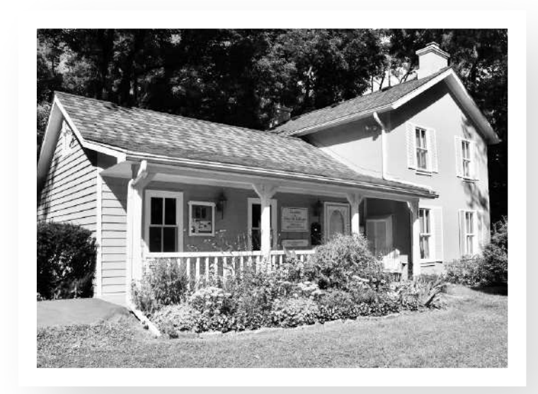
Charming Sovereign House Gallery, at left

Two years later I shared the Gallery with another artist. On both occasions we were permitted to hold a Gallery opening where visitors were treated to refreshments. Sharing the space meant sharing the responsibilities making it easier to come and go. Over the years since my first exposition at Sovereign House, besides promoting my own art, I've had the pleasure of participating in group shows, where I met and networked with other artists.